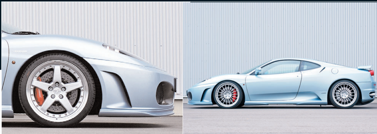
HAMANN | Light-alloy wheels design PG3 19"