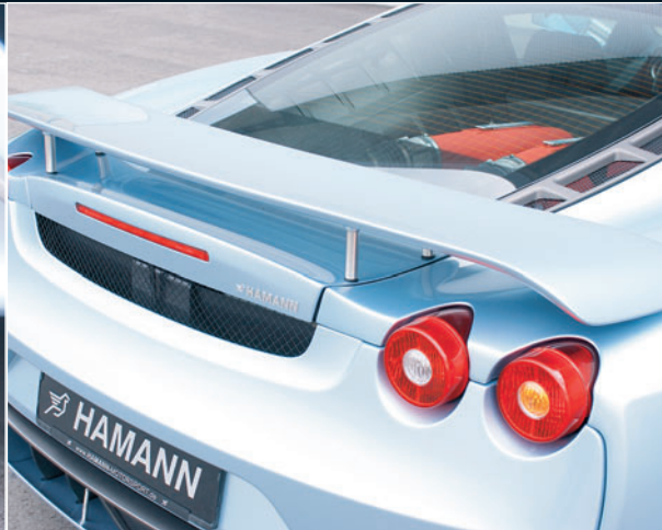
HAMANN | rear wing