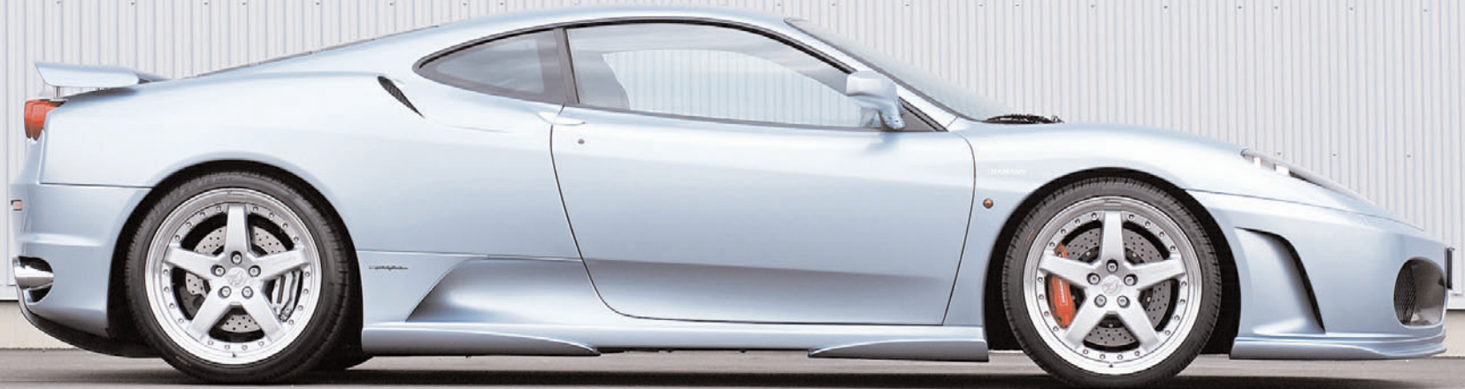
Ferrari F430 | with HAMANN front spoiler, side wings, rear wing in fiberglass version, lowering kit and split-rim HAMANN 19" light-alloy wheels design PG3.