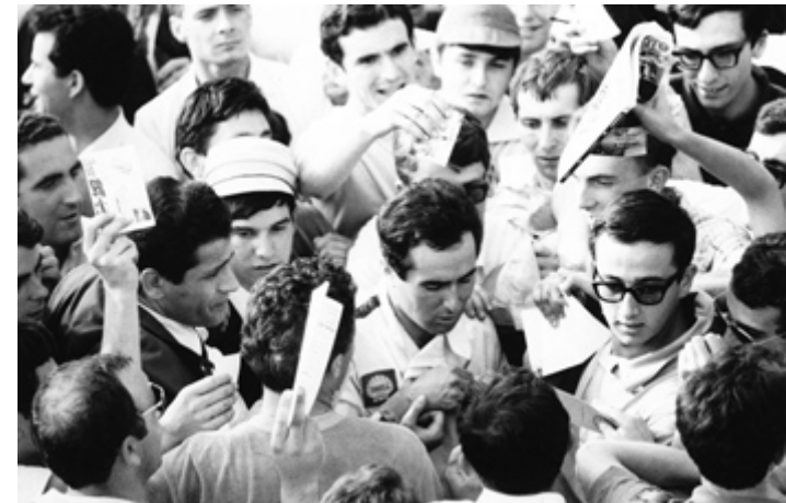
Monza, 25th April 1967 – The crowd celebrating Bandini's and Amon's victory at the 1,000-kilometre-race.

A star is switched off, 365 days after a terrible accident at the Targa Florio, which he survived without harm. Bandini dies at the climax of his career, missing the right entrance into a corner on the track he loved most. Ferrari, his family and his friends lose a person, who was able to realize his own dreams, although in the beginning no one would have put his money on the success of this man, except he himself.