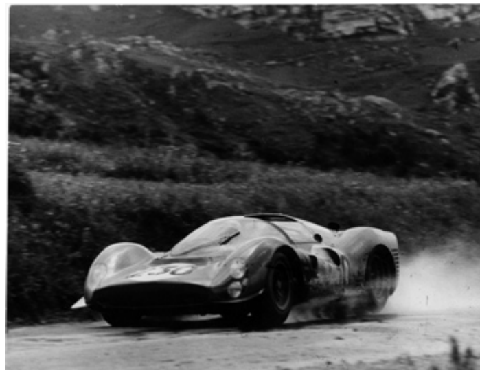
Madonie Circuit, 8th May 1966 - Bandini in full speed at the Targa Florio with the 330 P3.