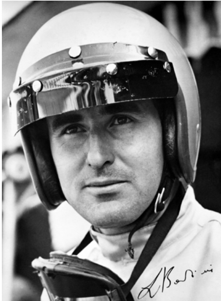
1962 - Lorenzo Bandini, the official driver of the Scuderia Ferrari.

Sunday, 7th May 1967 was the 25th time that the Monaco GP was held. The only race of the Formula One championship held on a street course. The conditions of this track are probably more adapted for a Rally than for a velocity race: pavements instead of curbs, the covers on the tarmac, protection set up with hay bails in the harbour area and the bollards lining the streets are the ingredients of one of the most difficult and demanding GPs ever. But during these days the world did not pay much attention to such details; the important thing was that there was a stretch of tarmac on which the cars could run against each other; the more demanding the track was, the better the drivers could show off their own and their car's