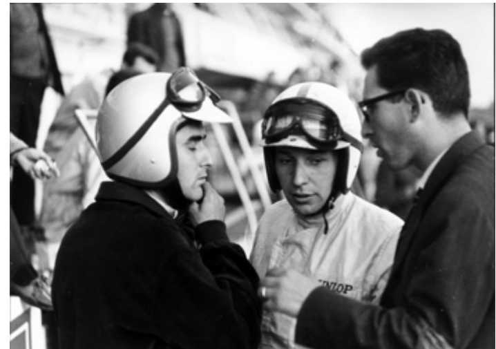
Le Mans, 20th June 1964 - Technical Director Forghieri talking to Bandini and Surtees. They come in 3rd behind the wheel of a 330 P.