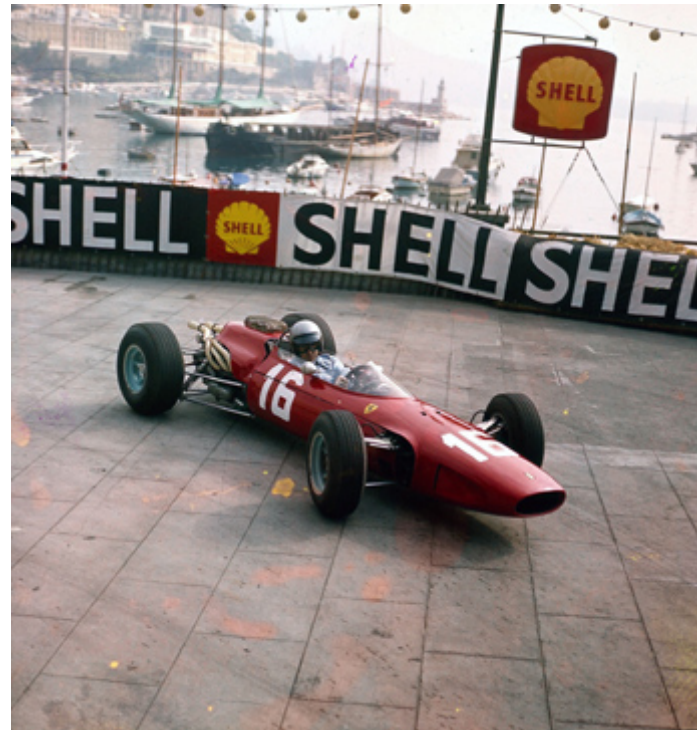
Monte Carlo, 22nd May 1966 - Bandini on the winding roads of the Principality.

In 1963 there is not much satisfaction for Bandini in Formula One, although the driver from Reggiolo manages to become one of the big shots, thanks to his results in the Constructors' Championship and the victory at the 24 Hours of Le Mans, where he wins together with Ludovico Scarfiotti. Bandini gains victory also at the Targa Florio, at Clermont Ferrand, at Brands Hatch and at the Enna GP. Lorenzo is now one of the stars in motor racing and the main driver for Ferrari in the Sport-Prototype category. If from outside it seems that he reached his goal, inside his mind he still has one goal to achieve, Formula One.