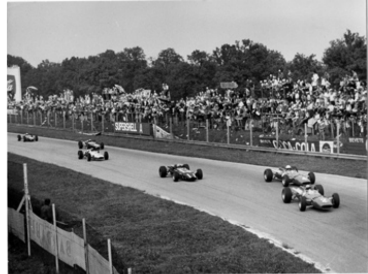
Monza, 4th September 1966 – Bandini (n.2) drives into the Parabolica ahead of the pack.

breaks; Lorenzo stops, has a look, salvages a wire and is able to cross the line at the end of the race – an exemplary behaviour, which makes him so admired by Enzo Ferrari, who loves to hand over his “creatures” to drivers who respect them.