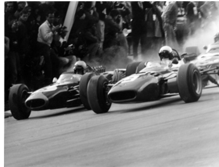
Watkins Glen, 2nd October 1966 – Bandini's 312 F1 (n.9) drives off at the start of the race.