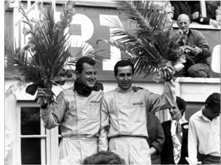
Le Mans, 16th June 1963 - Lodovico Scarfiotti and Lorenzo Bandini, winners of the 24-hour-race.