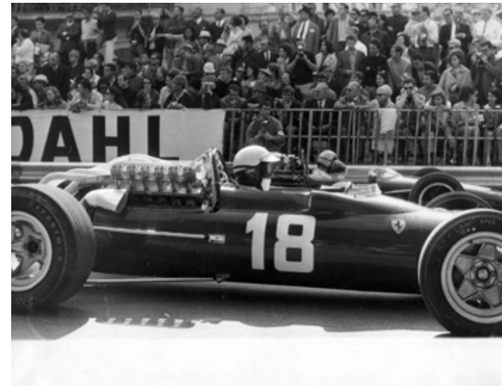
Monte Carlo, 6th May 1967 - Lorenzo Bandini during the free practice session before his last race.